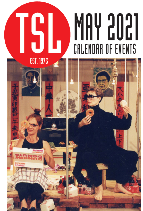
“Mao Wow” (1999), The Mussmann/Bruce Archive